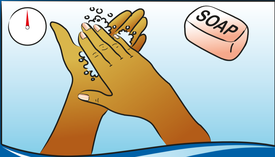
Lather hands with soap and water and rub hands palm to palm