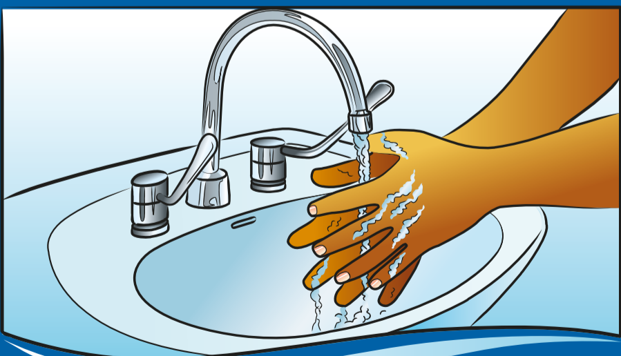
Rinse hands with water