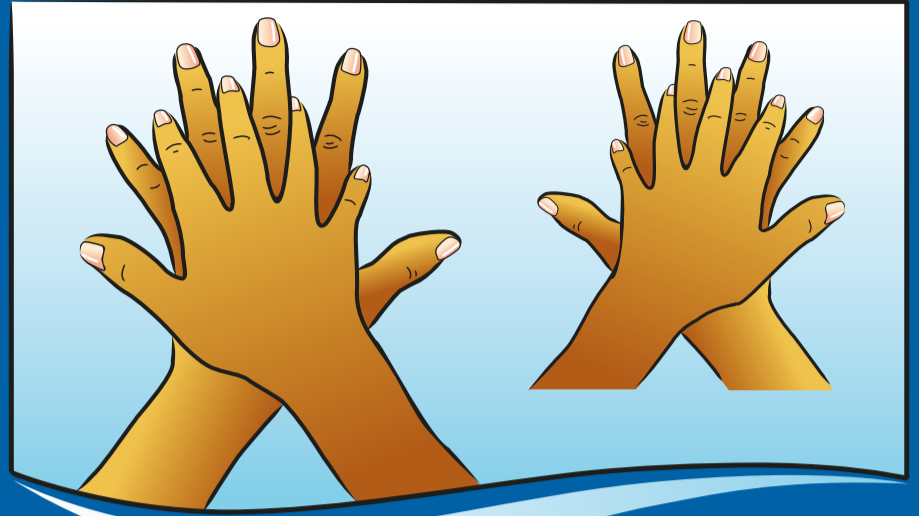
Right palm over back of left hand with interlaced fingers and vice versa