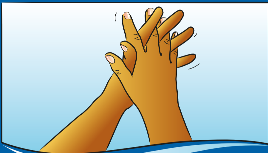
Palm to palm with fingers interlaced