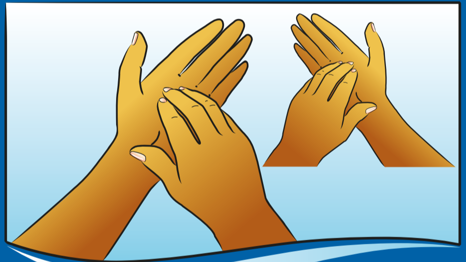
Rotational rubbing backwards and forwards with clasped fingers of right hand in left palm and vice versa