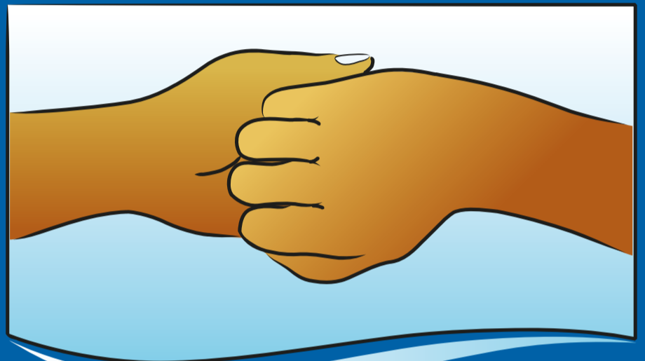
Backs of fingers to opposing palm with fingers interlocked