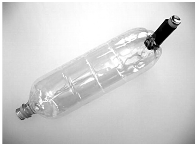
Image reproduced from British Medical Journal . Woollard M, Greaves I4 Shortness of breath Emergency Medicine Journal 2004;21:341-350

If spacers are not available, they can be made locally with a clean plastic bottle and dispensed for single patient use. Consider using ancillary staff or community volunteers to make lots of these.